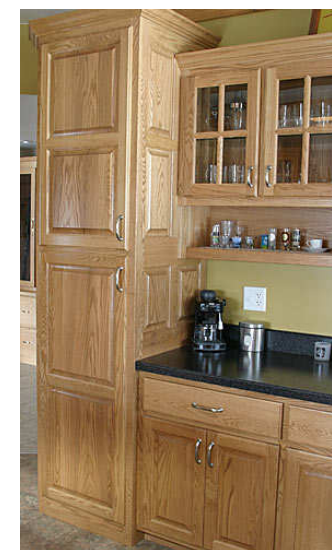
Oak cabinets are also popular.