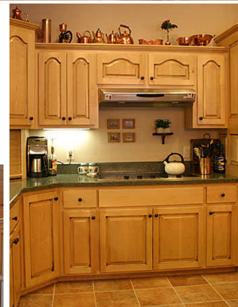
Maple cabinets with a glazed finish.

One of our most popular kitchens is Rustic Hickory (shown above). Clear Hickory is available as well. Other woods commonly used are Oak, Maple, Birch, Pine, Ash, Alder and Cherry.